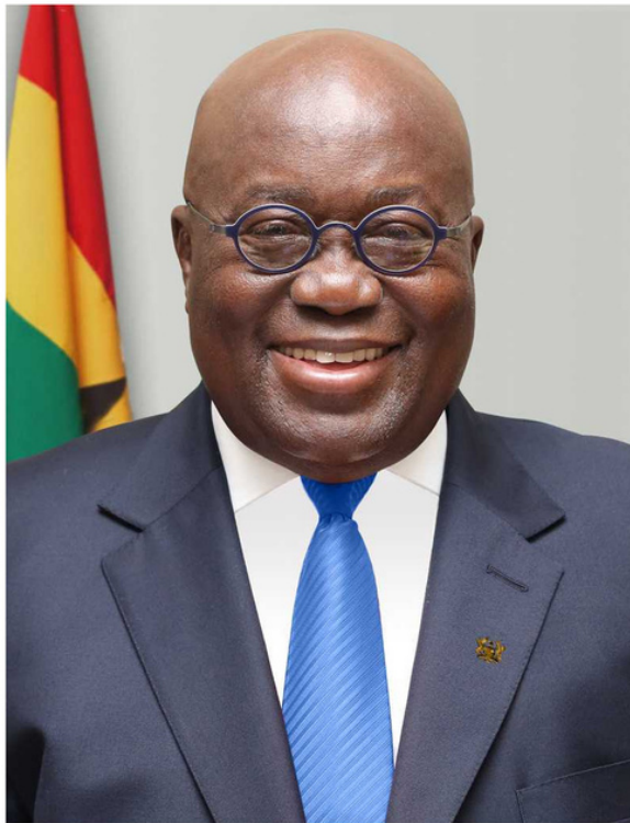
NANA ADDO DANKWA AKUFO-ADDO PRESIDENT OF THE REPUBLIC AND COMMANDER IN CHIEF OF THE GHANA ARMED FORCES

I have strong confidence in Foreign Minister Botchwey to lead our aspiration for renewal and for building future-looking resilient and thriving economies, through Community cooperation and action, as underscored at Kigali, Rwanda, during the 26 th Commonwealth Heads of Government Meeting (CHOGM). Her background as a political leader with both private sector and governance experience, including at high level positions in foreign affairs, trade and industry, communication as well as being a member of Ghana's National Security Council and, in recent years, as the chair of the ECOWAS Council of Ministers during the most challenging two years of terrorist activity, military coups and the most far-reaching reforms of ECOWAS, makes her eminently fit to take on the challenges we face as a community and to seize the opportunities for transformation.